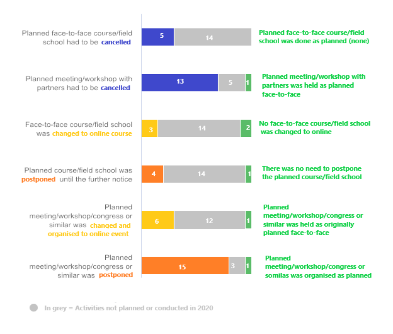
Figure 1 - Educational Activities

Moreover, 15 respondents had to postpone planned meeting/workshop/congress, with an average of 1.6 meetings, etc. postponed. Only 1 organized it as planned, while the rest did not plan any (see Figure 1).