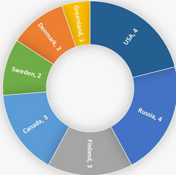
Count of Institutions by Country